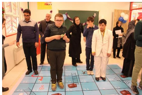
Disabled kids played "Snake and Ladder" which was an exciting game for them.