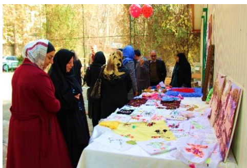
Traditional Iranian handicrafts made by children were displayed.