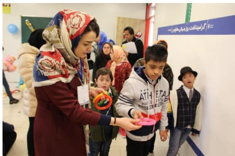
Volunteers attended at ceremony, play and paint with children. The kids painted their dreams for us.