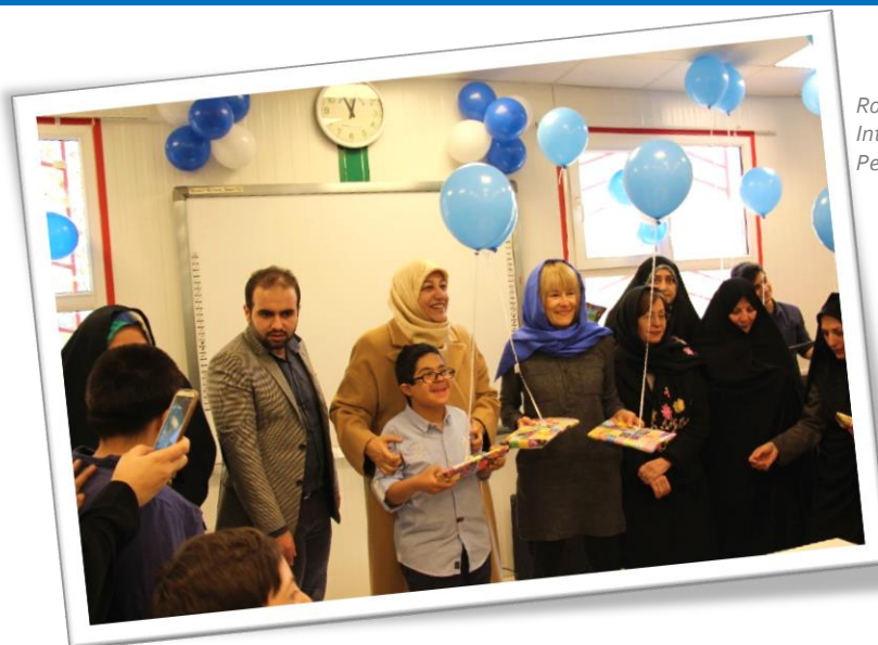
Roshd & UNIC celebrate International Day of Persons with Disabilities